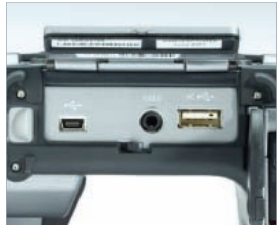
From Left to right: USB mini for PC image download, NTSC video, USB-A for memory stick image transfer